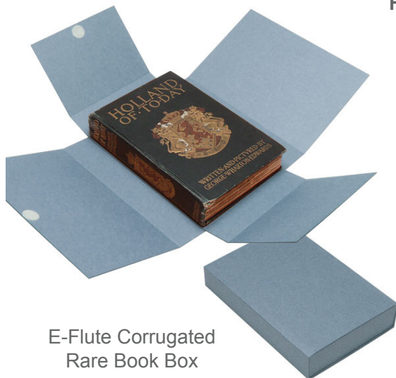
E-Flute Corrugated Rare Book Box