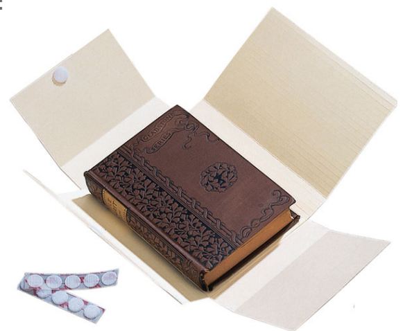
Adjustable Rare Book Storage Box